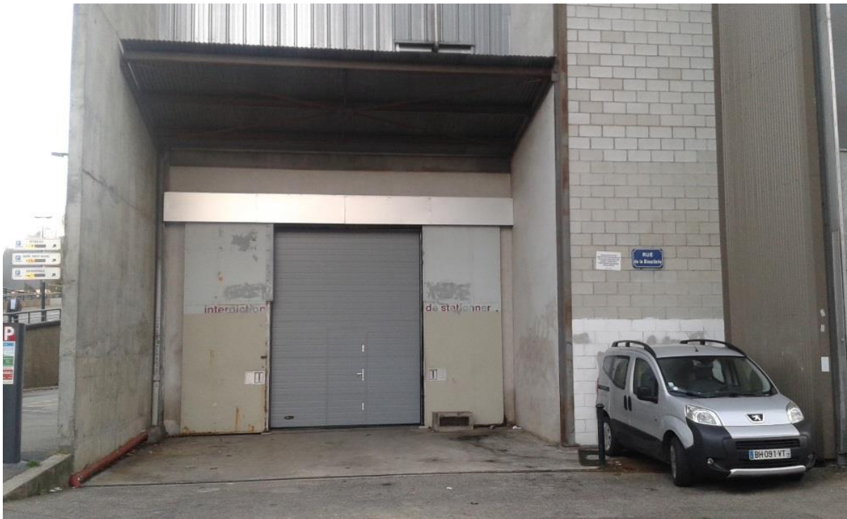
Dimensions delivery door : H=3,96m et L= 2,98m

Maximum height of 2 lateral flying bars : 7,70m