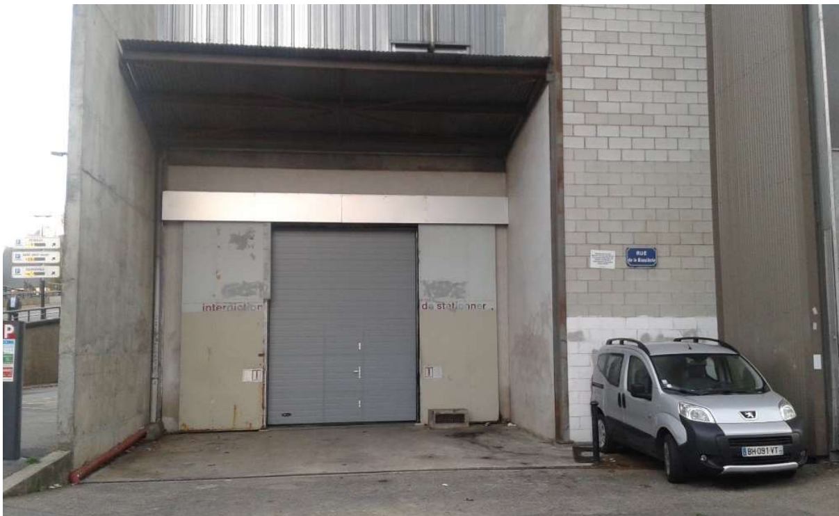
Dimensions delivery door : H=3,96m et L= 2,98m

Maximum height of 2 lateral flying bars : 7,70m